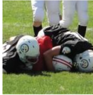
I think he's down...