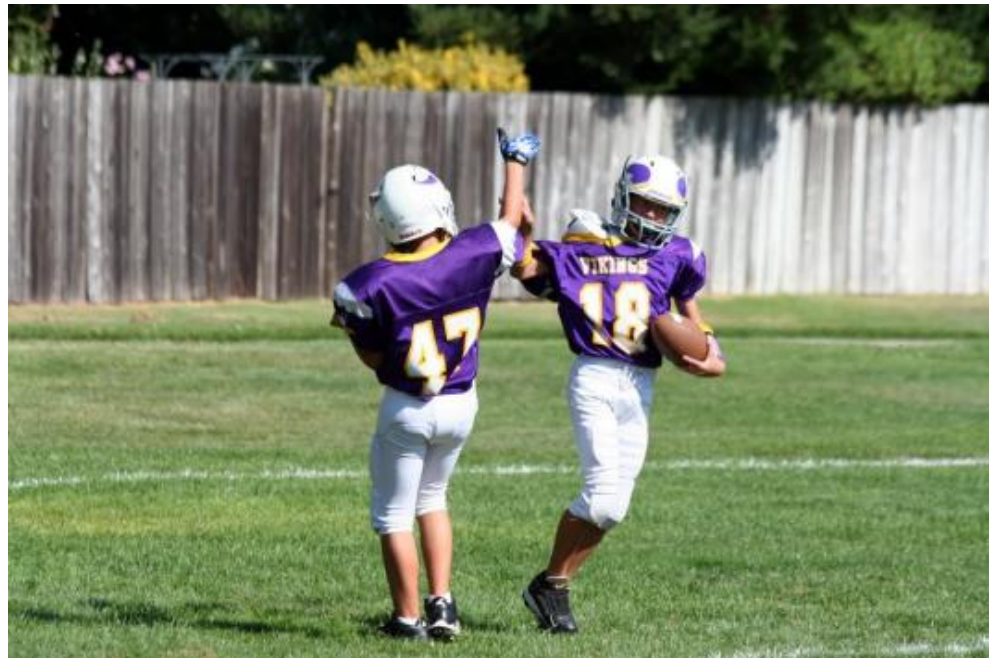
That's the Viking Spirit!